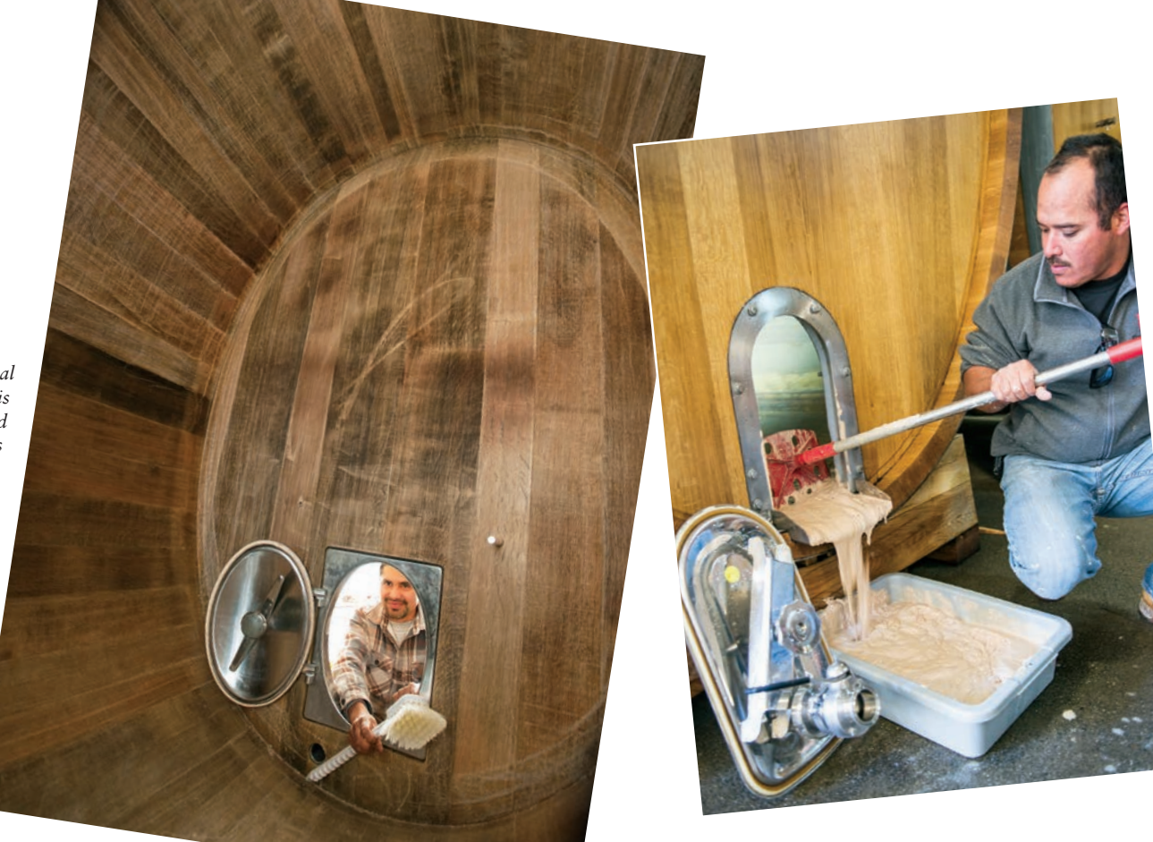
Alfredo removing yeast lees from an oval. This wine rested on the spent yeast for seven months, improving the mouthfeel and clarifying naturally so that it required only minimal filtration at bottling, thus preserving the wine's depth.

Ulises about to enter an oval to clean it. When a cask is this large, the oak staves and heads are about two inches thick without any knots. The slow oxygenation that occurs in an oak cask means the winemaker can age the wine on the yeast for a much longer period of time than in an impervious stainless steel tank.