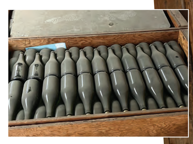
Soon to be disgorged 2017 Brut. A lot of dust accumulates after four years en tirage in a chilly cellar.